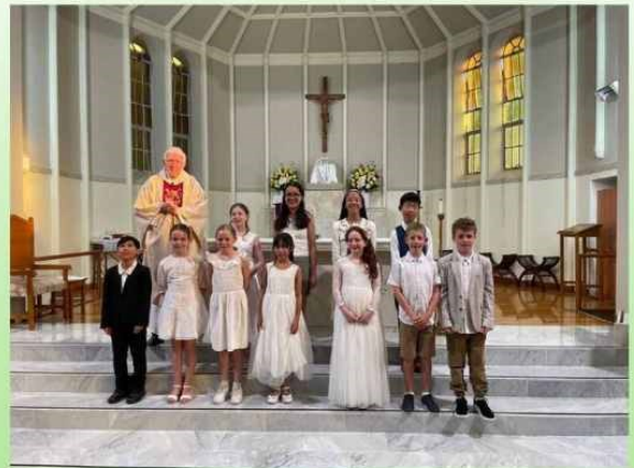
Last weekend's celebration of First Holy Communion at Lindfield